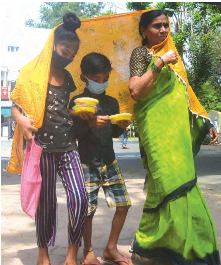
A woman covers her children from heat waves on Mother's Day in Bhopal on Sunday.